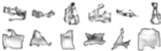
Figure 3: Generated images from DRAW with a VGP (top), and DRAW with the original variational auto-encoder (bottom). The VGP learns texture and sharpness, able to sketch more complex shapes.